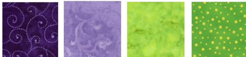
dark and light purples for candy light and bright green for candy

www.quiltingbythebay.com 850-215-QBTB(7282) email: qbtb@knology.net