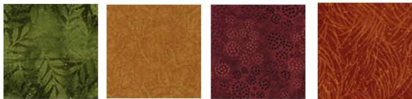
green leaves gold leaves red leaves dark gold leaves