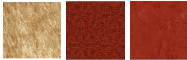
tan pumpkin stem dark orange pumpkin med. orange pumpkin

2" black square is for spider head 3" white square is for candy corn